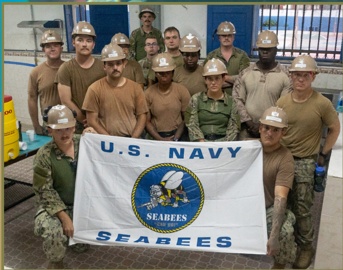
PANAMA CITY, PANAMA (June 28, 2025) - U.S. Navy Seabees with the Mercy-class hospital ship USNS Comfort (T-AH 20) and U.S. Air National Guard members from Missouri pose with the Seabee flag during Continuing Promise 2025 in Panama City, Panama, June 28, 2025. Navy Seabees and Air Guard Civil Engineers teamed up to improve Panamanian school through the Missouri State Partnership Program. The U.S. National Guard has deployed alongside other U.S. military branches on humanitarian missions since 1996.