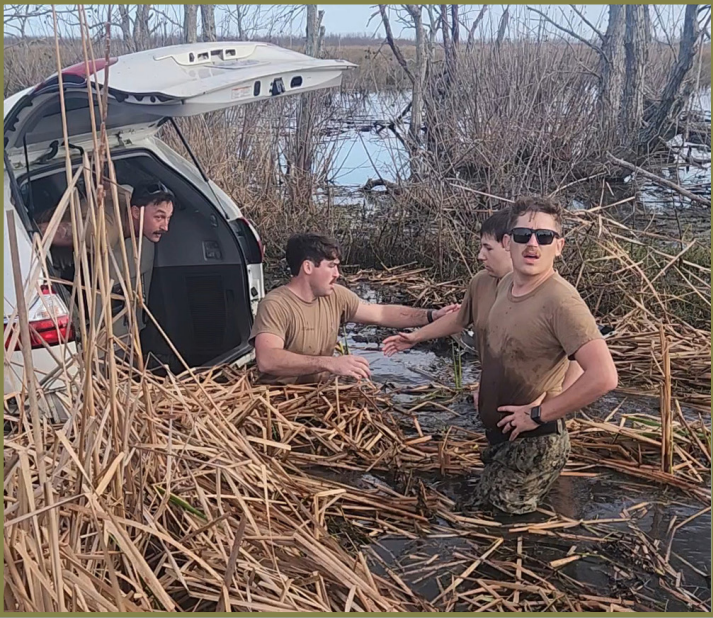
◀ NEW ORLEANS – U.S. Navy Seabees assigned to NMCB 11 recover personal effects from a submerged vehicle after carrying its occupants to safety outside of New Orleans, Feb. 6, 2024. NMCB-11, assigned to Naval Construction Group TWO, is homeported in Gulfport, Ms. as part of the Naval Construction Force.