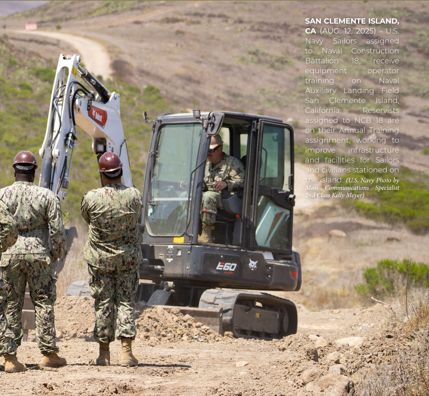
SAN CLEMENTE ISLAND, CA (AUG. 12, 2025) - U.S. Navy Sailors assigned to Naval Construction Battalion 18, receive equipment operator training on Naval Auxiliary Landing Field San Clemente Island, California. Reservists assigned to NCB 18 are on their Annual Training assignment, working to improve infrastructure and facilities for Sailors and civilians stationed on the island.