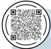
NAVY SEABEE MUSEUM Port Hueneme, CA