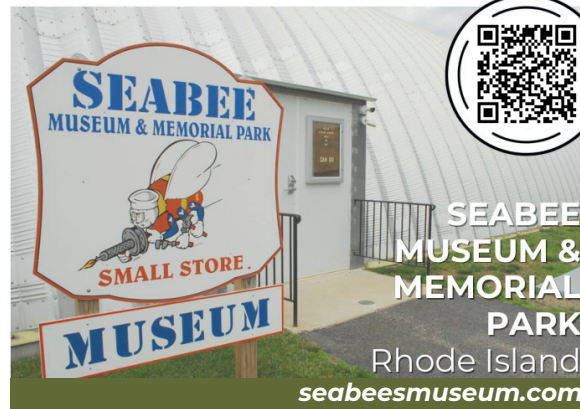
SEABEE MUSEUM & MEMORIAL PARK Rhode Island