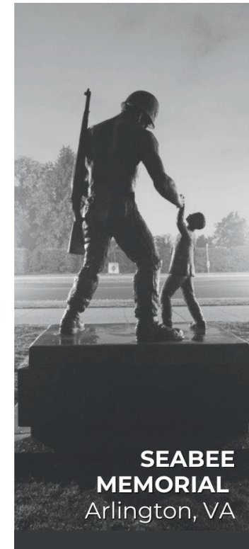
SEABEE MEMORIAL Arlington, VA