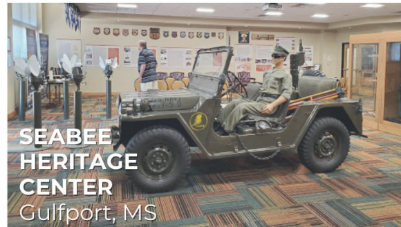
SEABEE HERITAGE CENTER Gulfport, MS