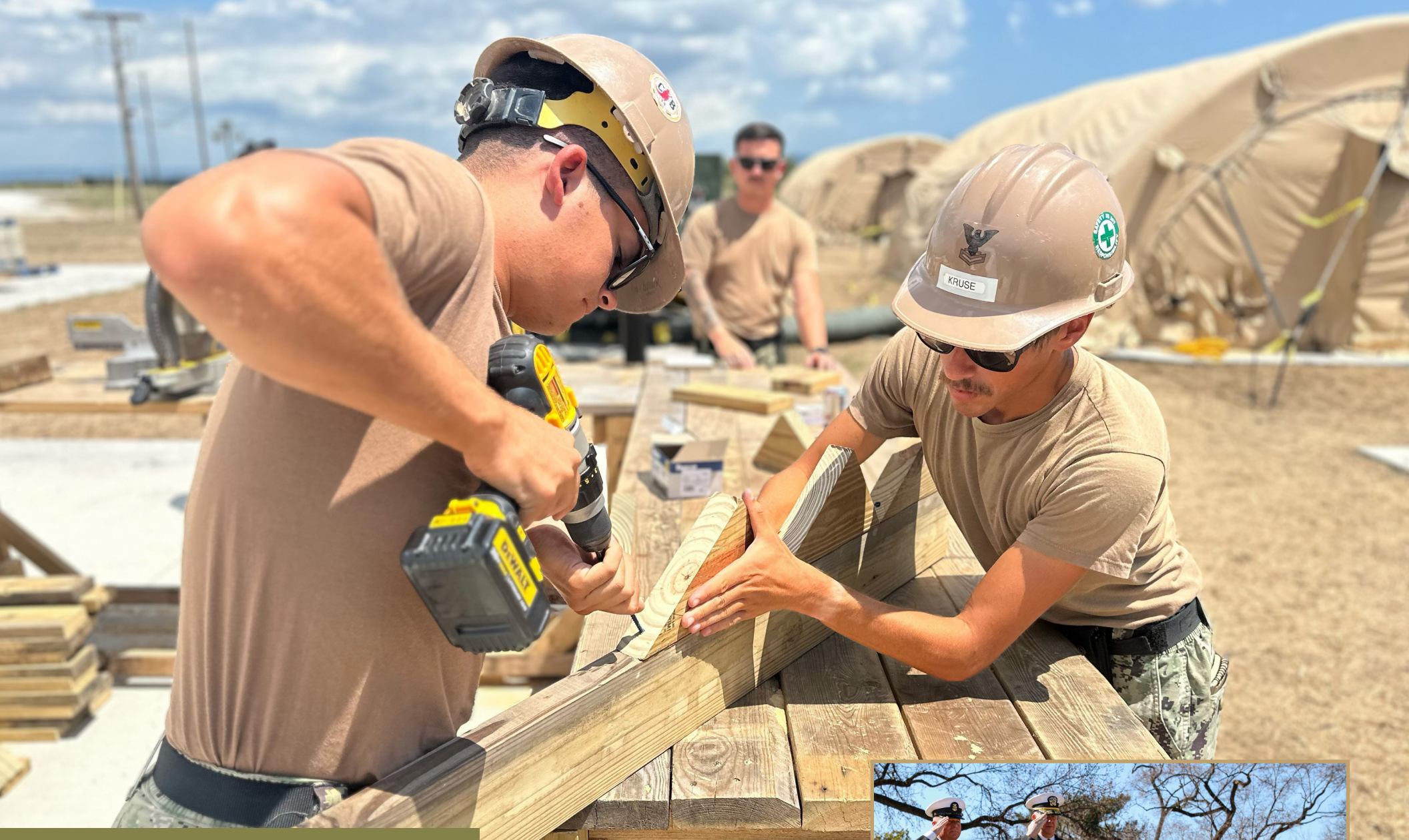
GUANTANAMO BAY CUBA (MAR. 12, 2025) - Seabees assigned to NMCB 133 build stairs for the Department of Homeland Security migrant operations center at JTF-SC supporting illegal aliens holding operations led by the Department of Homeland Security at Naval Station Guantanamo Bay, Cuba.